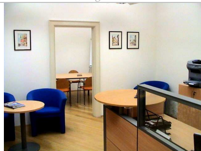
Reception - Coffee Court