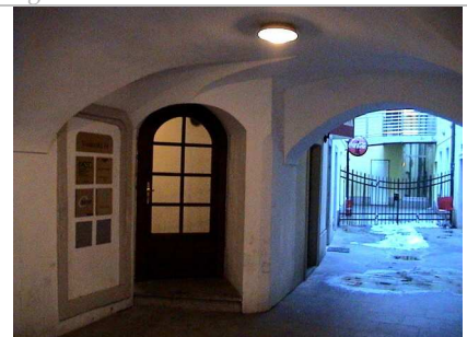
Prestigious Business Address