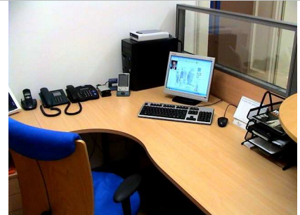
Phone Answering Service