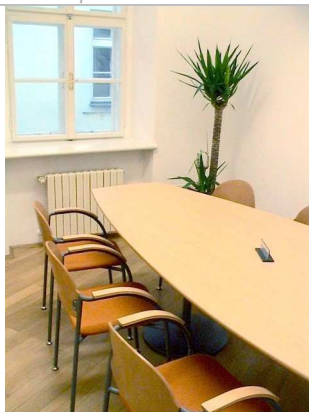
Equipped Meeting Room